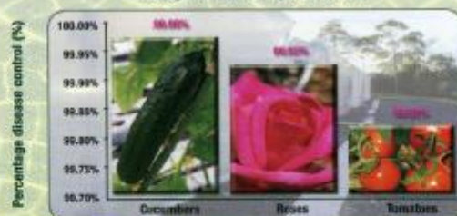
Control of Powdery Mildew in a variety of crops using eco-rose (4gm) + Syn. Horti