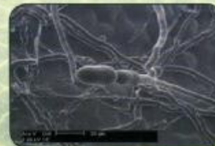
Fungal mycelium before application