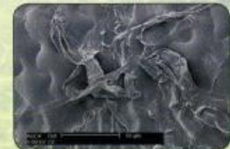
Fungal mycelium 5 minutes after application