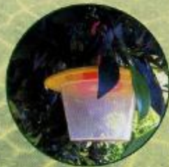
MALE FRUIT FLY TRAP

Note: Wick should be replaced every 3 months (round pink disk in trap). Call 1800 634 204 to re-order.