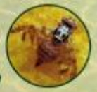
Mediterranean fruit fly ™