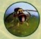
Queensland fruit fly ™