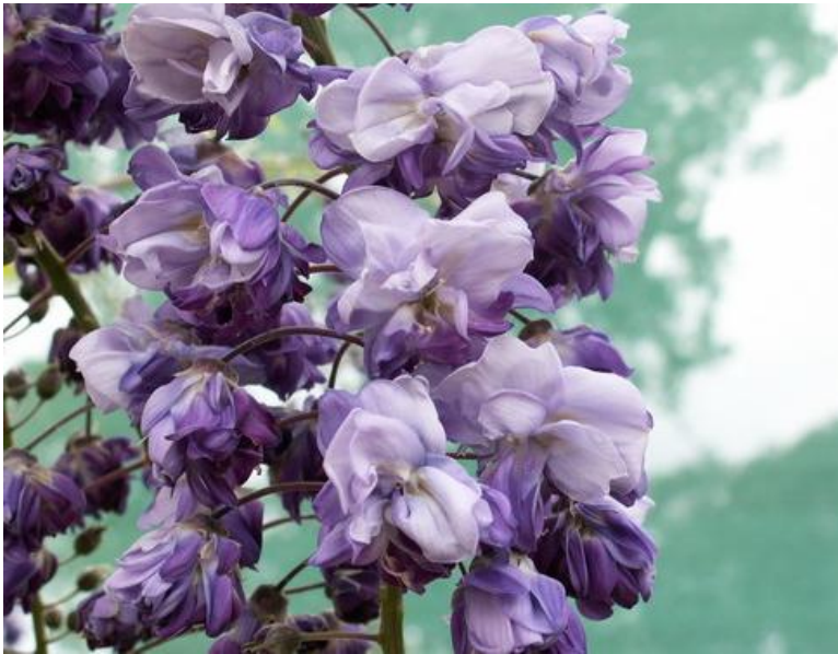
Wisteria floribunda violacea plena

Further reading: Peter Valder's "Wisterias A Comprehensive Guide", published by Florilegium (Australia) is probably the definitive guide.