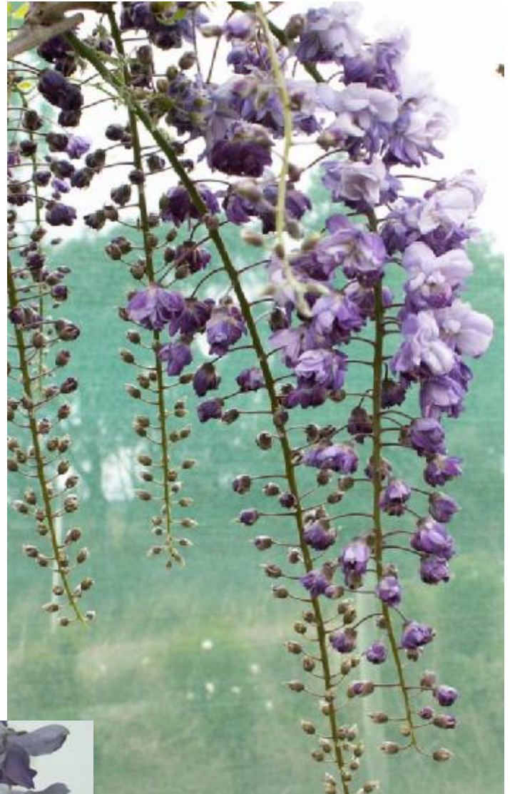
Wisteria floribunda violacea plena